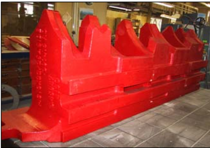
DISPOSABLE FOAM PATTERNS